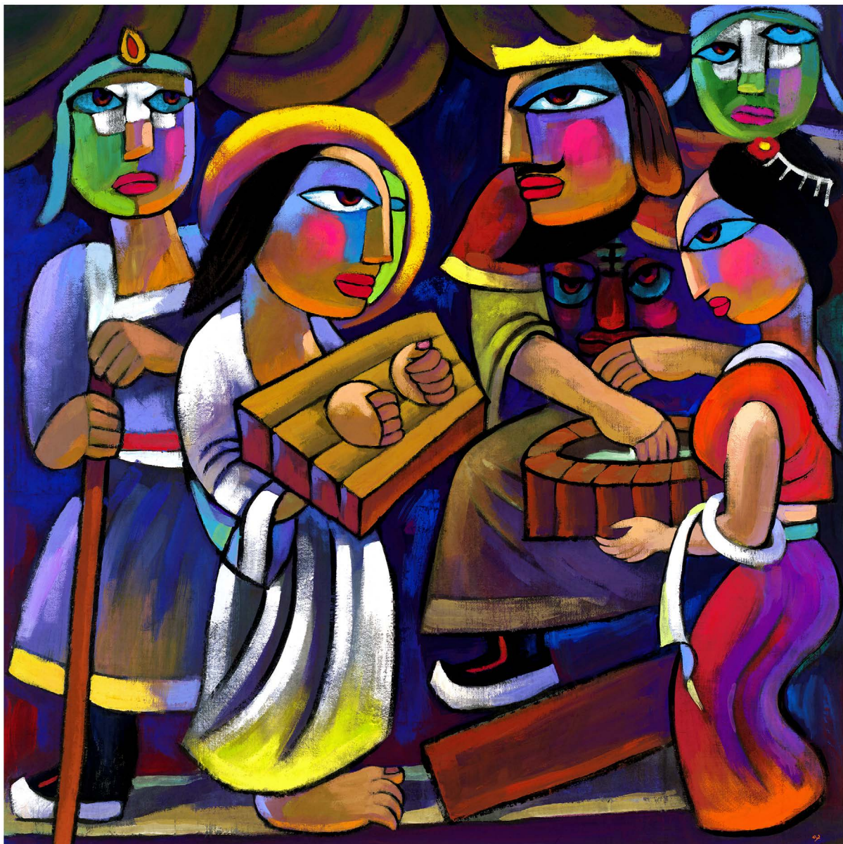
Cover Art, Pilate Washing His Hands, By Artist He Qi, He Qi © 2014 All Rights Reserved

GOOD FRIDAY CHURCH | 7 PM APRIL 15, 2022